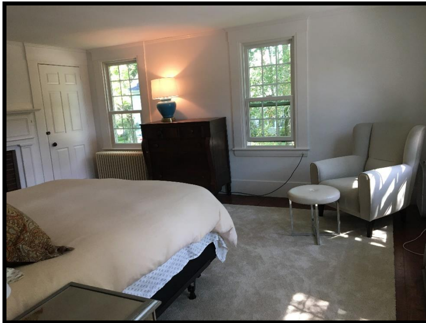
2 nd Floor - Guest Bedroom