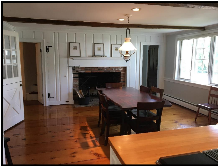
Side entry, and TV room