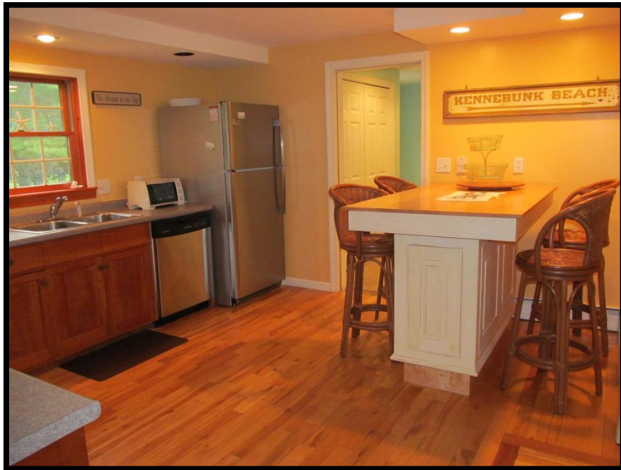
Living Room off kitchen