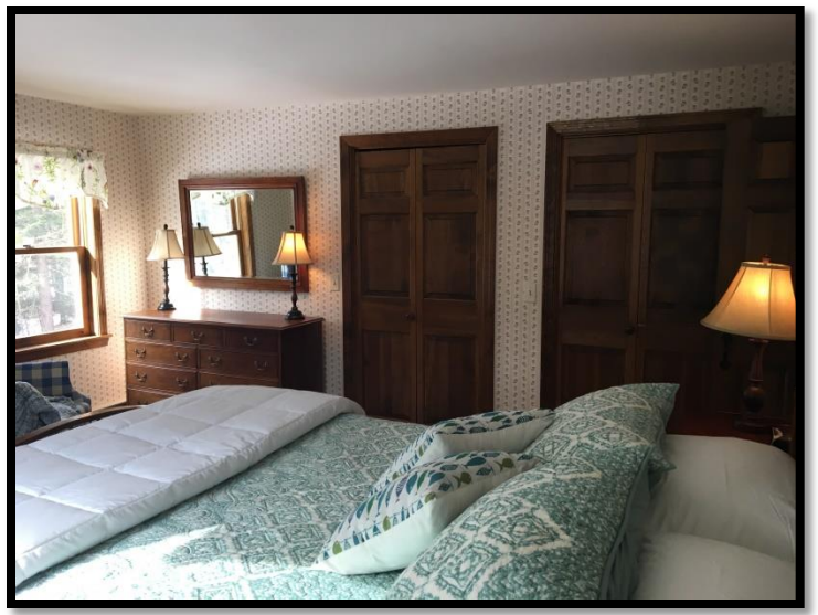
Master bedroom bath...